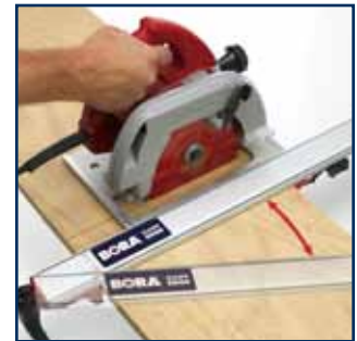
Circular Saw Guide