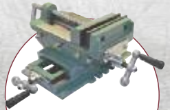
4" CROSS VISE Item 95-400 $64.99