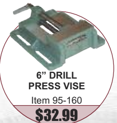
6" DRILL PRESS VISE Item 95-160 $32.99