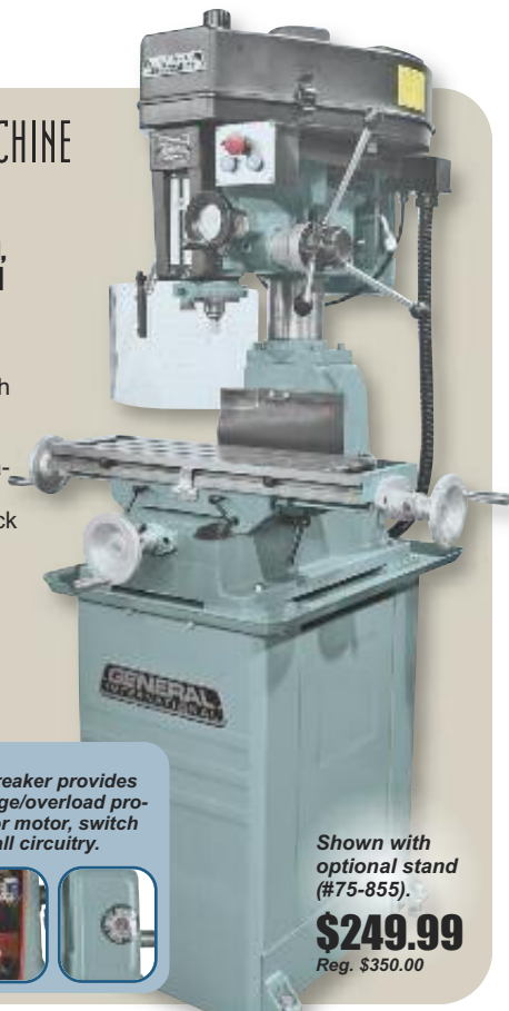
Shown with optional stand (#75-855).