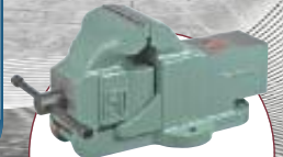
6" INDUSTRIAL BENCH VISE Item 95-860 $249.99